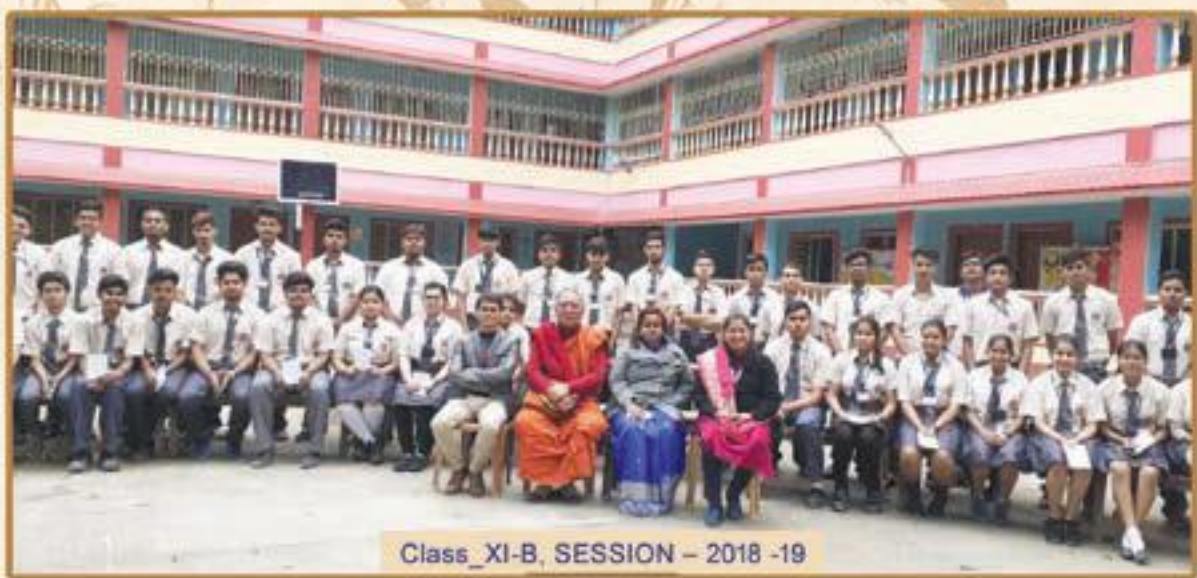
Class_XI-B, SESSION – 2018 -19