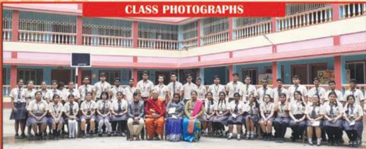
Class_XI-D, SESSION – 2018 -19