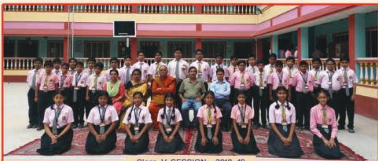
Class_V, SESSION – 2018 -19