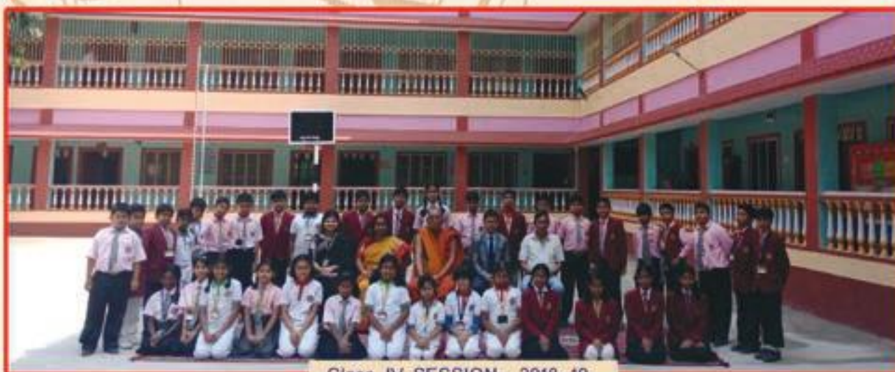
Class_IV, SESSION – 2018 -19