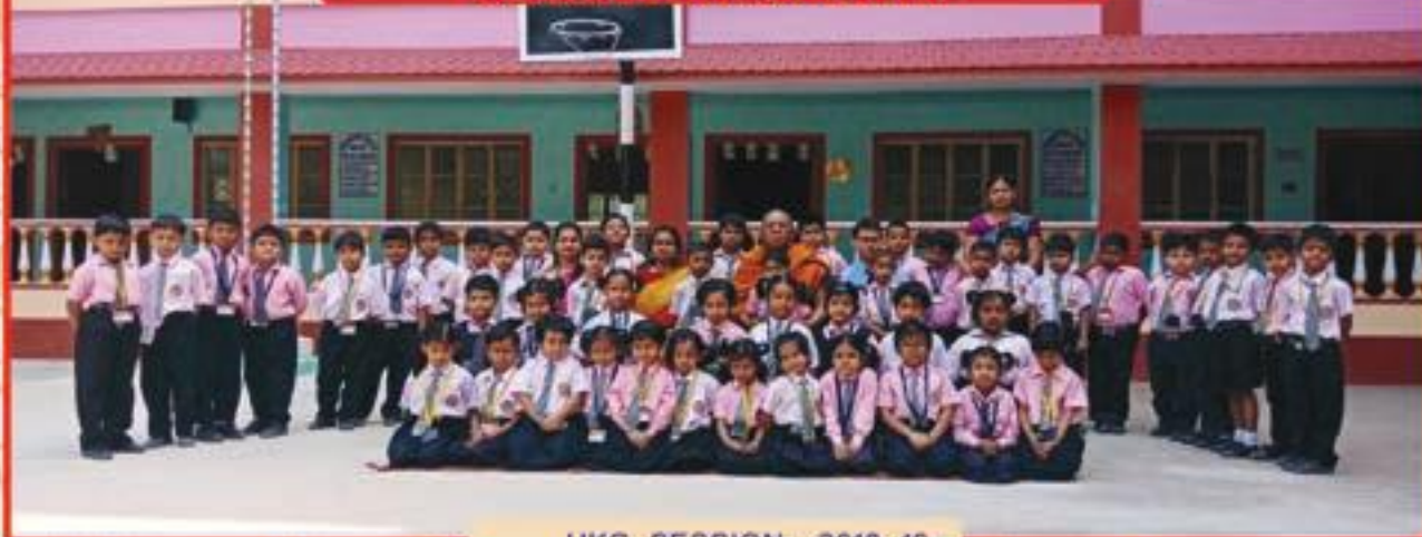
UKG, SESSION – 2018 -19