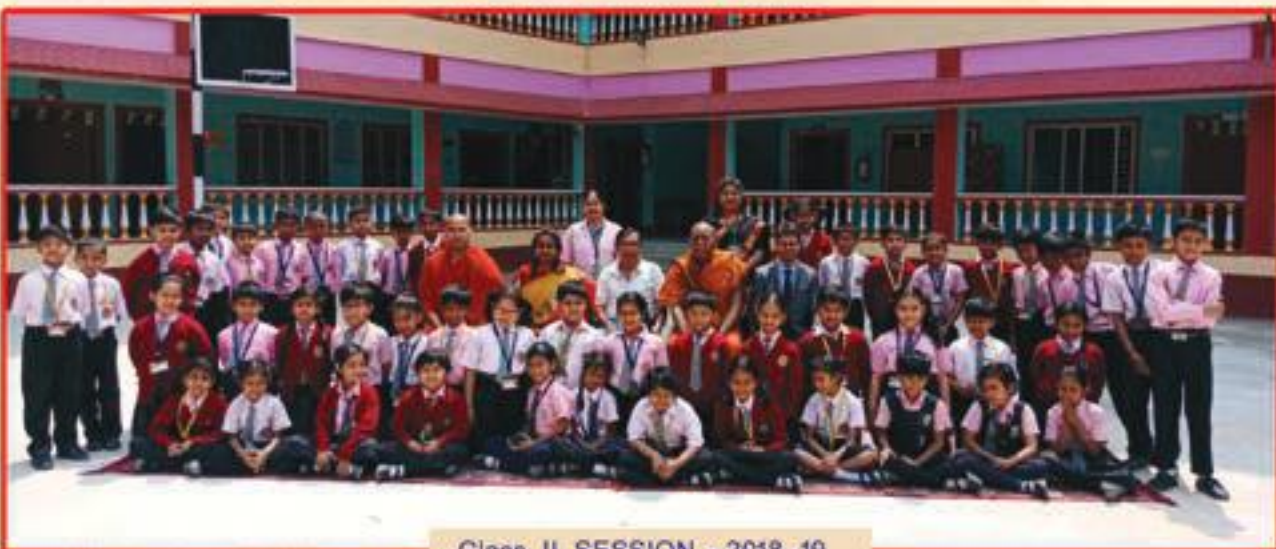
Class_II, SESSION – 2018 -19