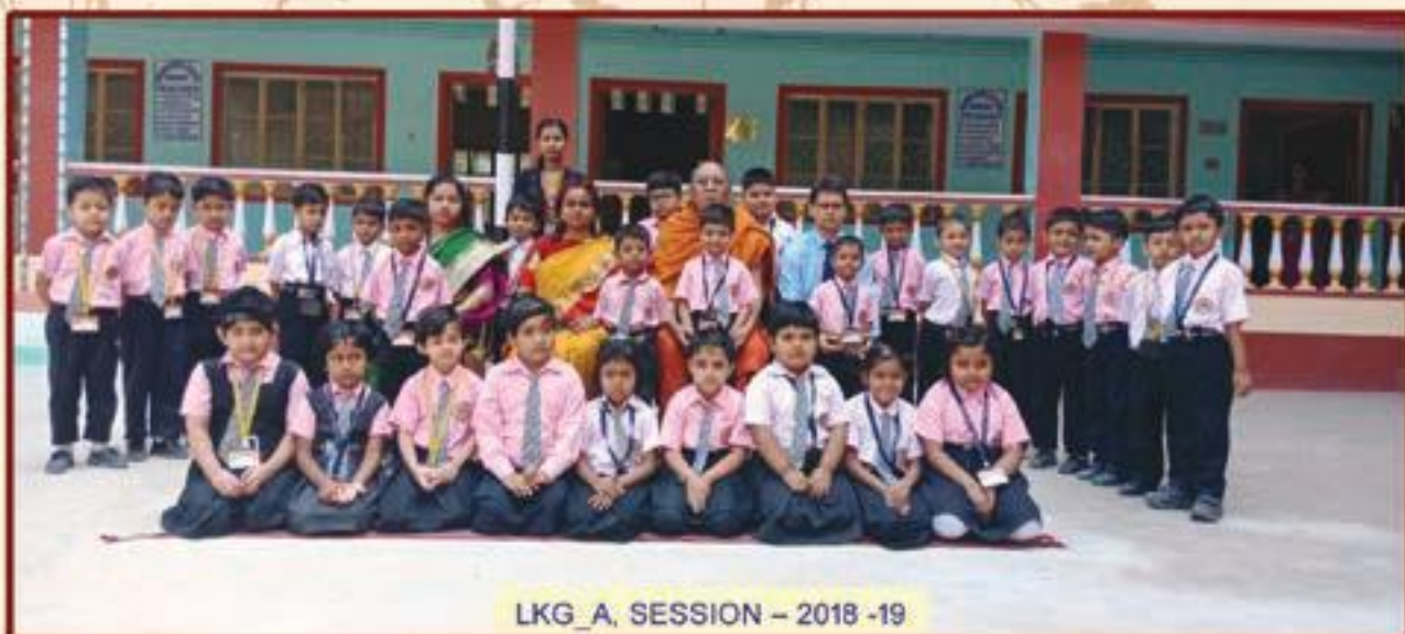
LKG_A, SESSION – 2018 -19