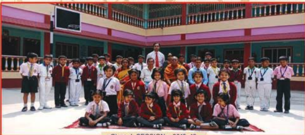
Class_I, SESSION – 2018 -19