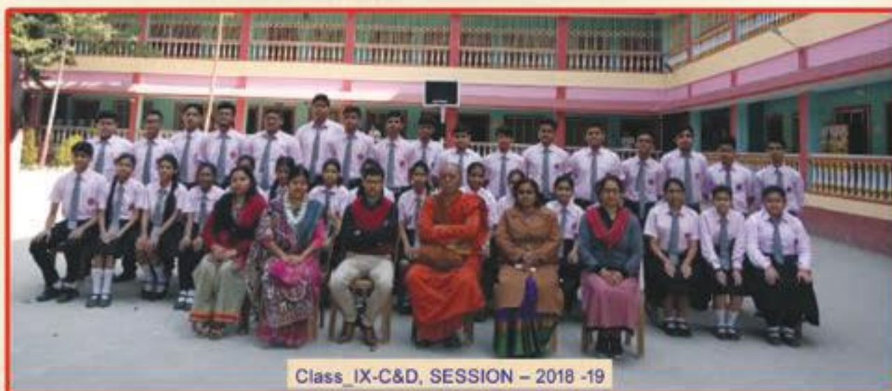
Class_IX-C&D, SESSION – 2018 -19