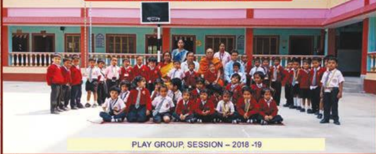
PLAY GROUP, SESSION – 2018 -19