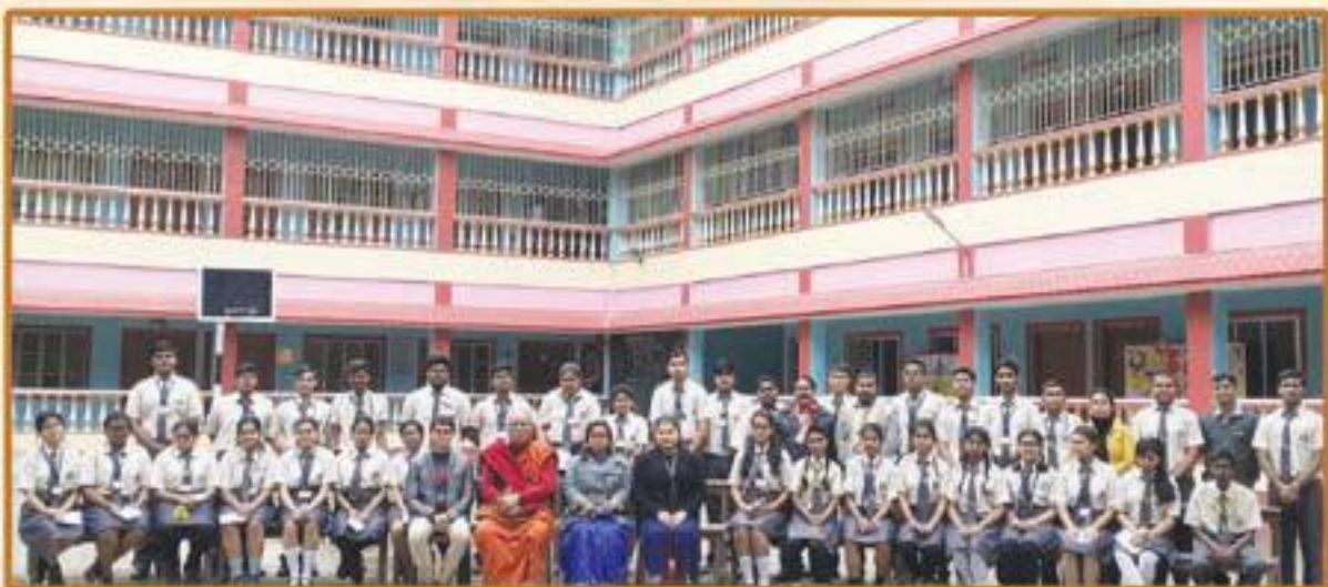
Class_XI-C, SESSION – 2018 -19