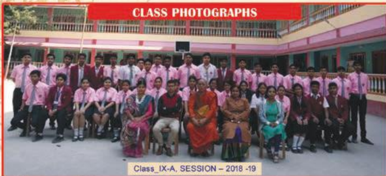
Class_IX-A, SESSION – 2018 -19