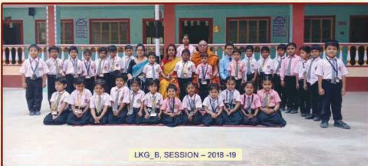
LKG_B, SESSION – 2018 -19