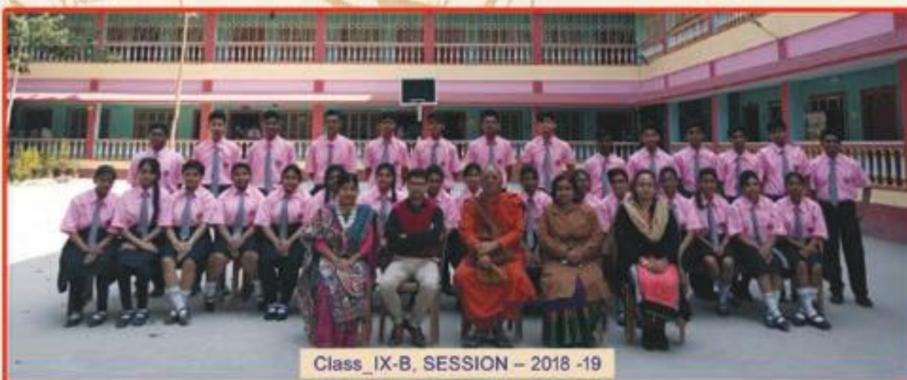
Class_IX-B, SESSION – 2018 -19